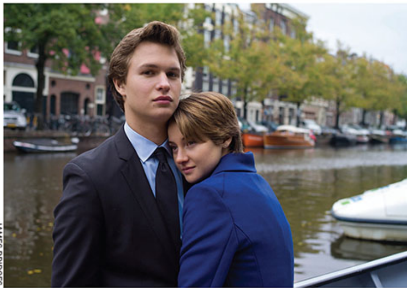
Hazel (Shailene Woodley) and Gus (Ansel Elgort) take in the sights during an unforgettable trip to Amsterdam.